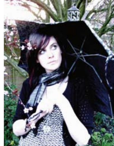
All Images shown are taken from Samuel Ward 6th form art show or taken by 6th form photography students.